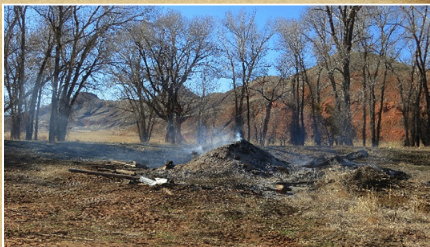
Burning Brush Piles.