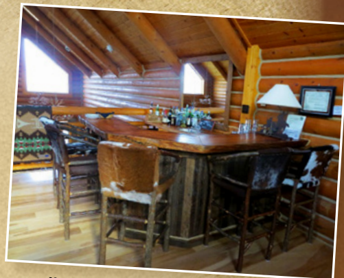
New Bar and Wood Floors in the Loft.