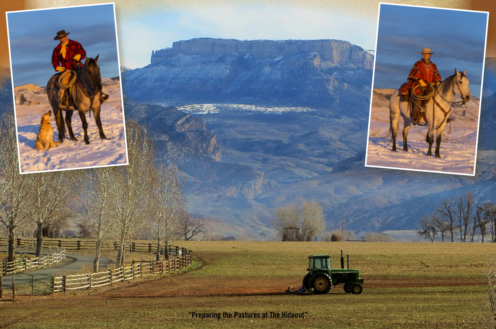
"Preparing the Pastures at The Hideout"