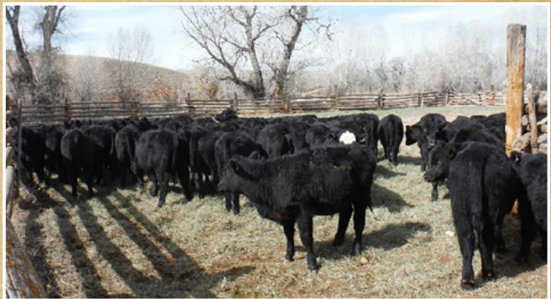
The Hideout steers arrive!

At the ranch the calving is going well with the warmer spring weather, so there will be a lot of cattle to move/check/herd this spring and summer. Last year for the first time, The Hideout team bought yearlings to graze on The Hideout and Trapper Ranch properties. We started with 29 head and this year we will have approximately 50 steers. These critters are not only eating grass but they are also here so our guests can learn how to work cattle and about the principles of stockmanship, prior to going out of the range to work cattle for the ranch. Of course we also use them for team penning and for the riders who are not able to participate in all-day cattle work on the range. This allows all levels of riders to get a taste of working livestock in the valley pastures.