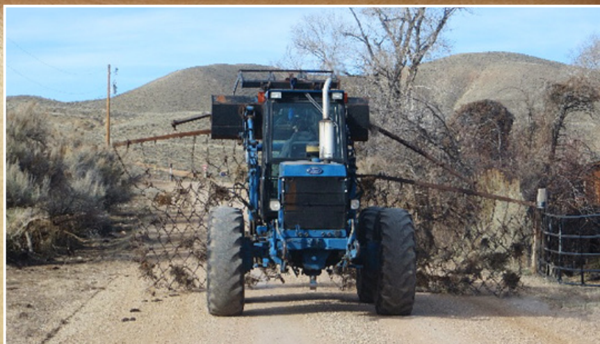
Getting Ready to prepare the fields for Spring.