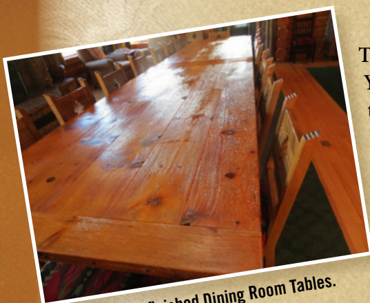
Shiny Refinished Dining Room Tables.

Out at Trapper, you may have seen a big building that was painted red and not the most attractive building at the ranch. This winter our local friend Don Pickens refurbished the old building to a much more attractive barn wood structure. Right now we use it for vehicle storage in the winter and for storing a whole host of other items we seem to collect, but Peter and Marijn have some future plans for this nice building.