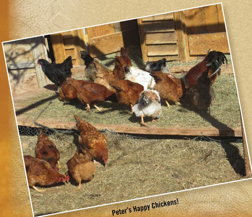
Peter's Happy Chickens!