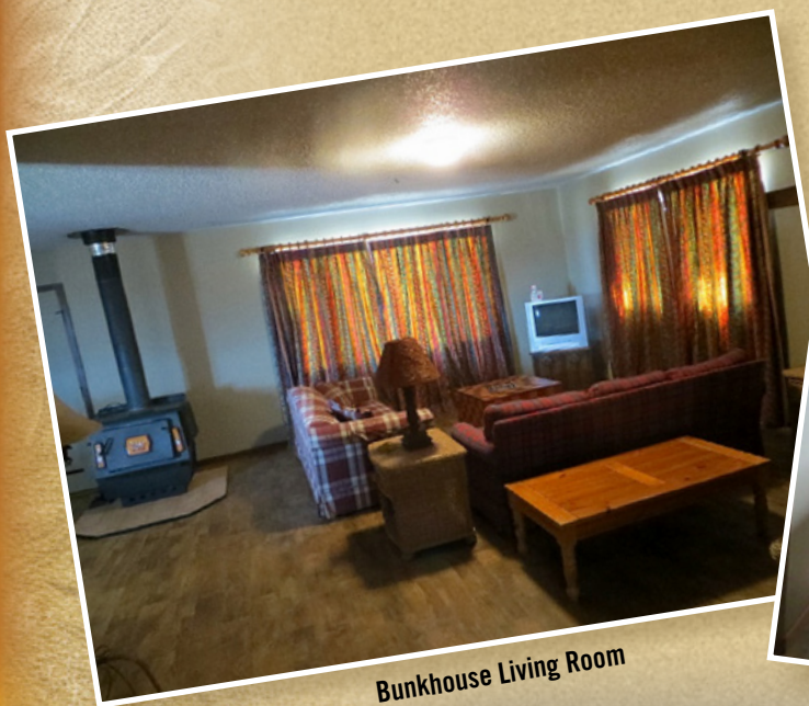
Bunkhouse Living Room

We are also refurbishing The Trapper Guest House, but that is news for the next newsletter.